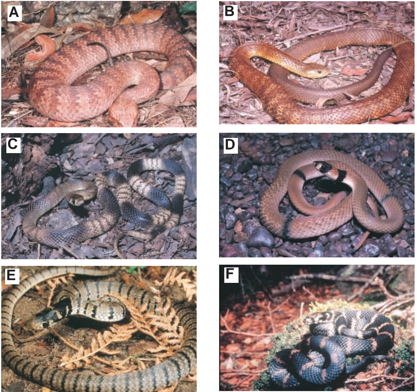
Figure 1. Six dangerously venomous Australian elapids with banded colour patterns. A. Common Death Adder ( Acanthophis antarcticus ); B. Eastern Tiger Snake ( Notechis scutatus ); C. Western Brown Snake ( Pseudonaja nuchalis ); D. Ringed Brown Snake ( Pseudonaja modesta ); E. juvenile Eastern Brown Snake ( Pseudonaja textilis ); F. Stephens' Banded Snake ( Hoplocephalus stephensi ).

This article has two purposes: to highlight several specific problems in venomous snake identification, and to provide a summary of recent data on the geographic distribution of the venomous species which are known or thought to be potentially dangerous to humans, livestock and pets. Such data can be useful in identification by reducing the number of possible candidates in an area. Although broad Australia-wide distribution maps are provided in many