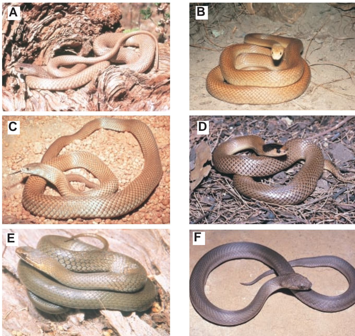
Figure 3. Six Australian elapids with predominantly brown colouration. A. Eastern Brown Snake ( Pseudonaja textilis ); B. Taipan ( Oxyuranus scutellatus ); C. King Brown or Mulga Snake ( Pseudechis australis ); D. Little Whip Snake ( Suta flagellum ); E. Swamp Snake ( Hemiaspis signata ); F. Bardick ( Echiopsis curta ).

( P colletti ) is more reddish, blotched or irregularly banded with tan, red and grey. The King Brown or Mulga Snake ( P australis , Figure 3C) provides an even more confusing common name. Although it is brown in colour (but varying from tan to almost black, the latter in the south of the range), it is unrelated to the Brown Snakes, and has a venom most similar to that of other