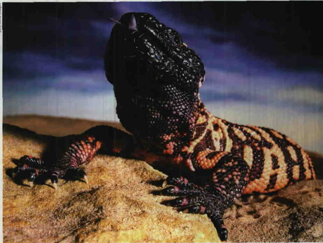
Spitting distance: the saliva from Gila monsters could lead to treatments for type II diabetes and obesity

Although much of the interest in the fibans stems from their specificity for GP IIb/IIIa, there are other snake venom proteins with inhibitory actions at other integrins, opening up additional therapeutic targets. For example, a group in Taiwan has reported that acutinin from the hundred-pace snake ( Agkistrodon acutus ) — presumably different from the previously characterised thrombin-like protease called 'acutinin' from the same venom — blocks integrin \alpha\text{V}\beta_3 on endothelial cells lining blood vessels