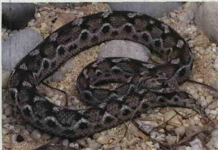
The sawscaled viper: disintegrins from snake venom can prevent blood clotting

at Parke-Davis to screen for low-molecular-weight compounds with selective actions on N-type \text{Ca}^{2+} channels.